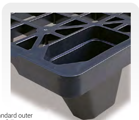
► Standard outer rims of 7 mm.

i 60 units per pallet. 1980 units in one truck.