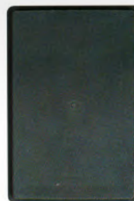
➤ Solid base