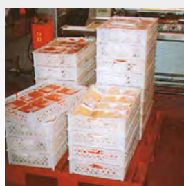
➤ Canned food